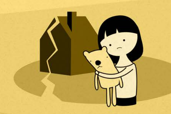
When parents struggle with addiction, children are neglected and families collapse.