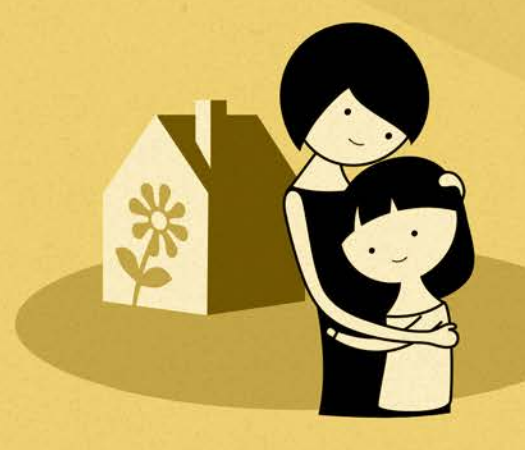
We heal the parents and the children, and help them find hope again.