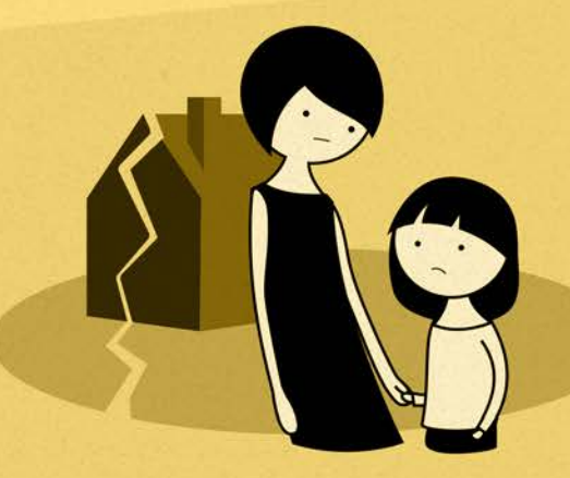
We find these struggling families before they break apart.